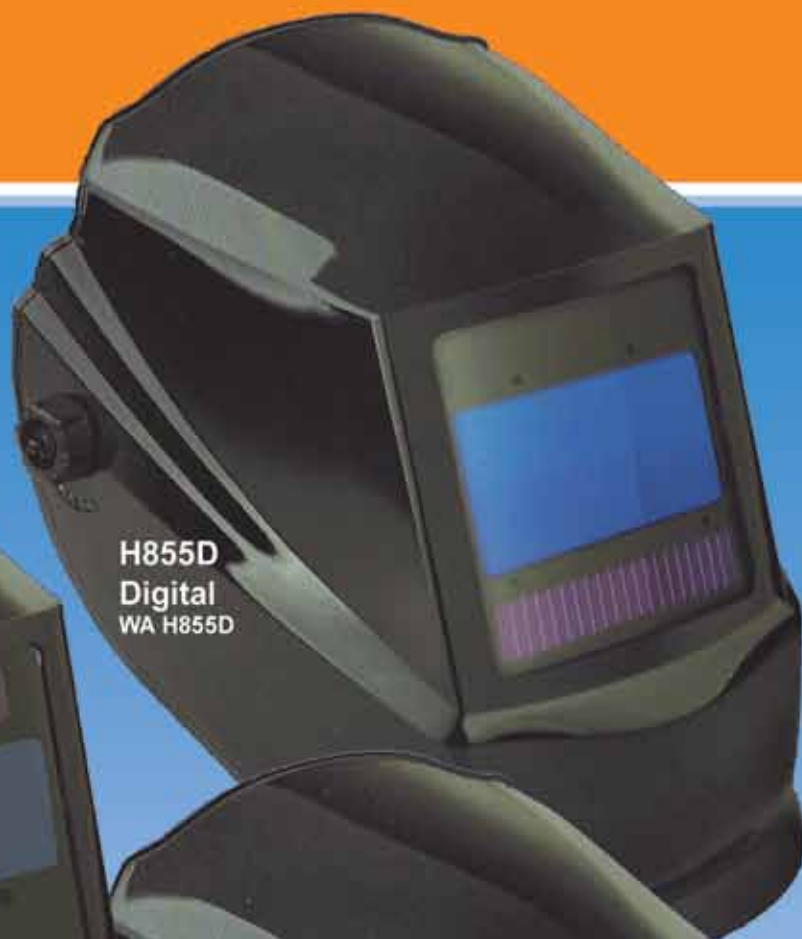
H855D Digital WA H855D