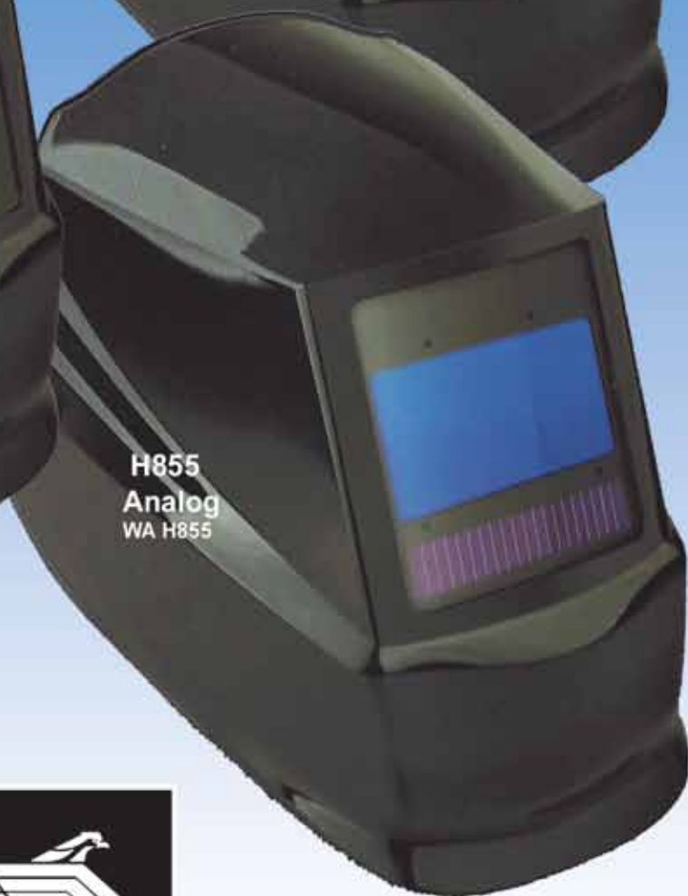
H855 Analog WA H855