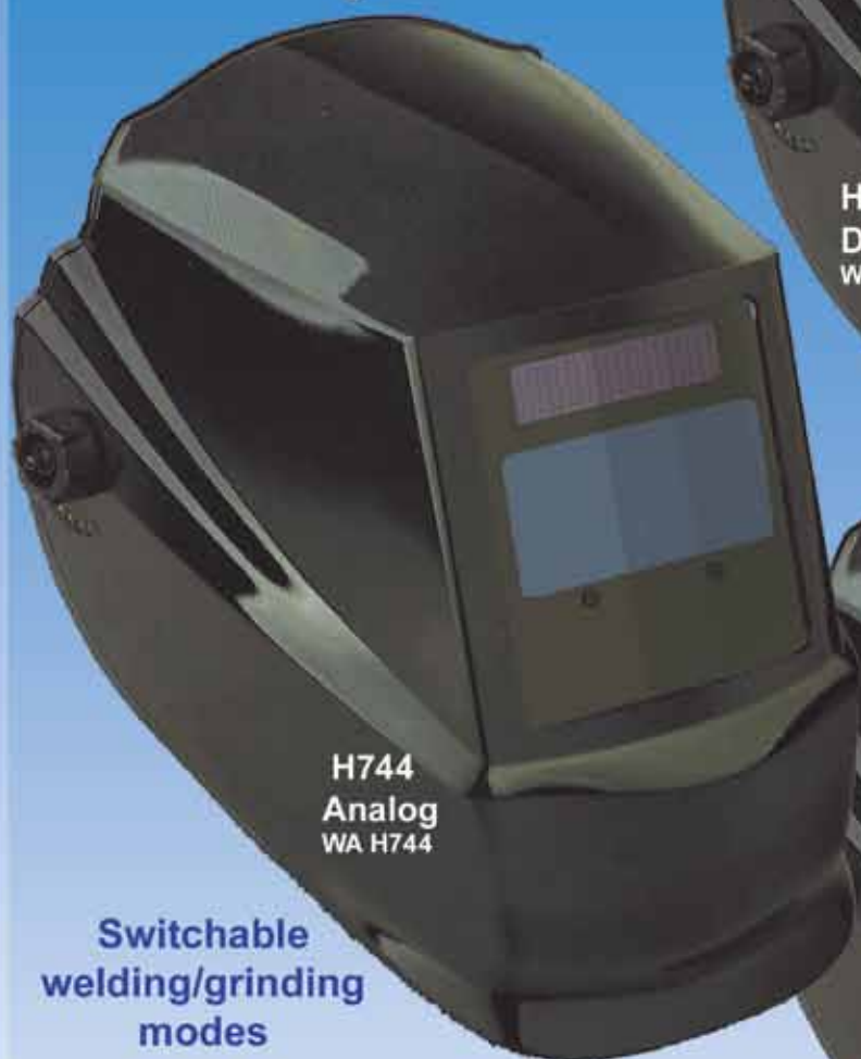
H744 Analog WA H744